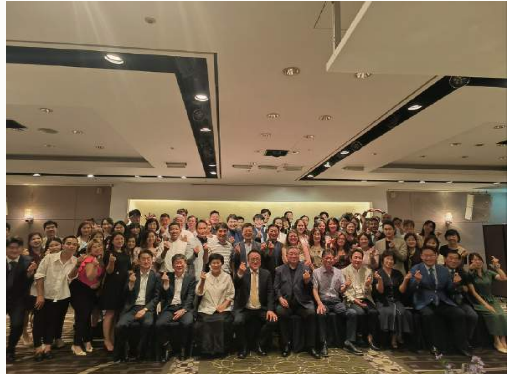
ARISU KOREA DMC 30th Anniversary Party